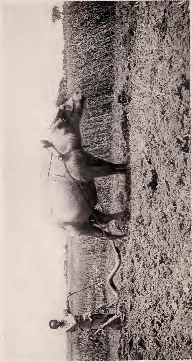
A Chinese farmer plowing with the rude implement of his forefathers drawn by a water buffalo